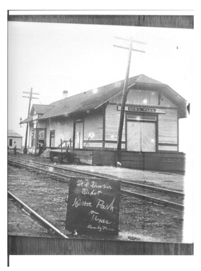
Above - Iowa Park Depot